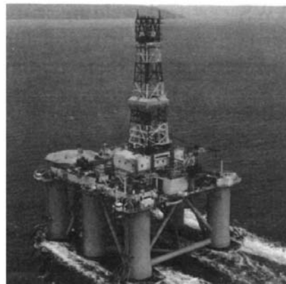
Western Oceanic Inc.