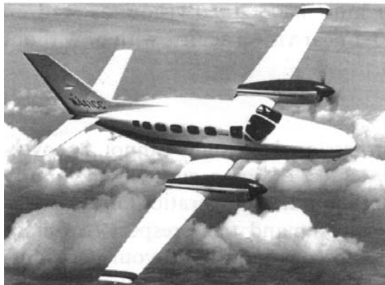
Cessna Aircraft Corporation