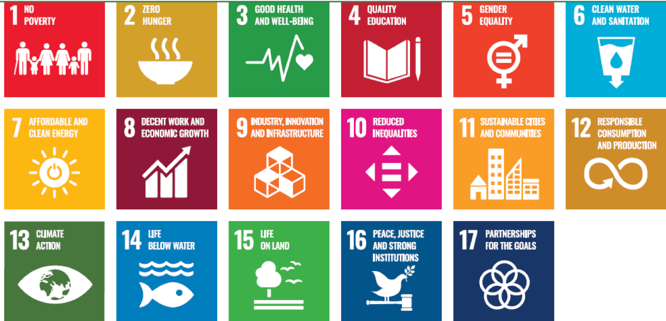
Figure 3 — The icons of the United Nations Sustainable Development Goals (SDG)

This is a preview of "BS EN 15643:2021". Click here to purchase the full version from the ANSI store.