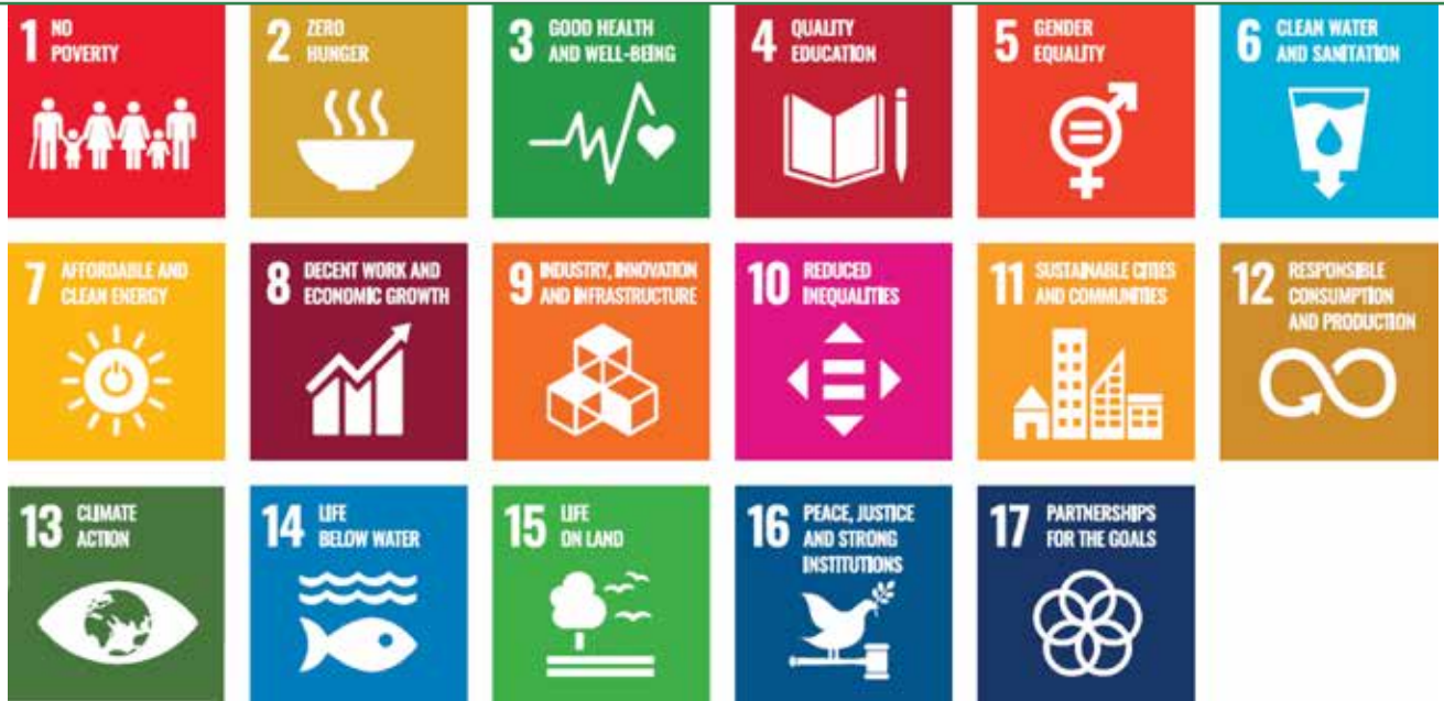
Figure 3 — The icons of the United Nations Sustainable Development Goals (SDG)

This is a preview of "DS/EN 15643:2021". Click here to purchase the full version from the ANSI store.