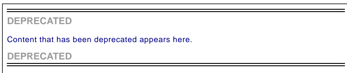
Figure 4 - Deprecated Tag

Deprecated sections are documented with a reference to the last published version to include the deprecated section as normative material and to the section in the current specification with the replacement. Figure 4 contains a sample of the typographical convention for deprecated content.