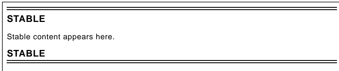
Figure 3 - Stable Maturity Level Tag

maturity level shall not rely on any content that is Experimental. Figure 3 is a sample of the typographical convention for Implemented content.